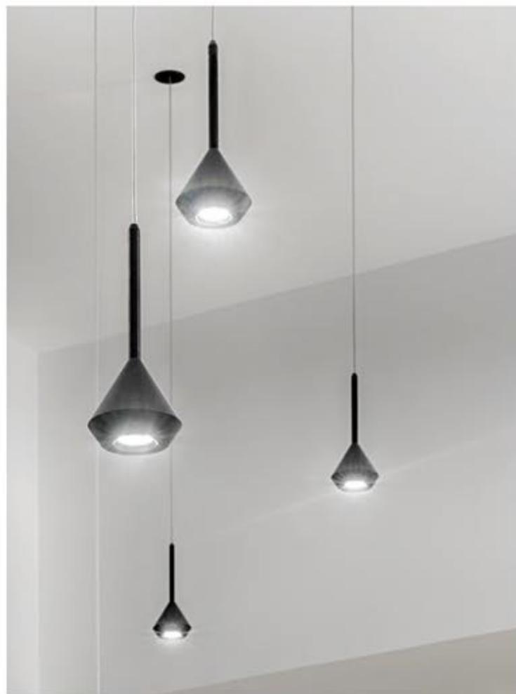
Spin hanging lamps.

The new Bulthaup showroom in Valencia, designed by Alfredo Monzó from Moncly Interiorismo and Rubén Muedra Estudio de Arquitectura, occupies a 280-m 2 space on the lower levels of the landmark Torre Valencia building. In their lively location next to the River Turia, the architects opened the showroom to the outside world with a floor-to-ceiling glass façade. This bathes the 100-m 2 ground floor space in daylight, which, thanks to its double height and open stairwell, also permeates the 180-m 2 basement space below.